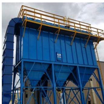
Top Bag Removal Rectangular STJ

Our full range of rectangular and cylindrical baghouses, including side and top bag removals. Customizable to fit any space. Great for the toughest of air pollution control challenges.