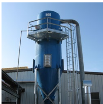
Top Bag Removal Cylindrical CTR