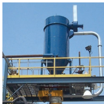
Side Bag Removal Cylindrical CBR