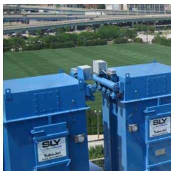
Side Bag Removal Rectangular SBR