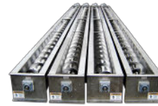
Stainless & Exotic Alloys