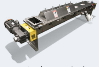
Continuous Lab Mixer