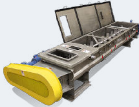
Continuous Paddle Mixer