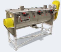
ES Sanitary Mixer