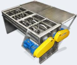
Batch Ribbon Mixer