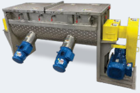
Heating & Cooling

Robust construction with a proven designs to deliver superior, uniform mixing and blending. Batch, continuous, ribbon, paddle and custom agitator mixing designs are available.