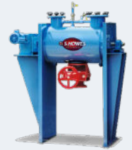
Vacuum & Drying