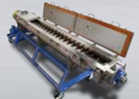
Heating & Cooling