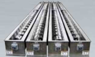
Stainless & exotic alloys