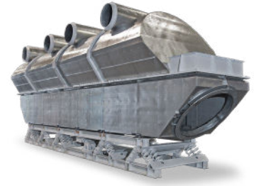
High-Temperature Vibrating Fluid Beds