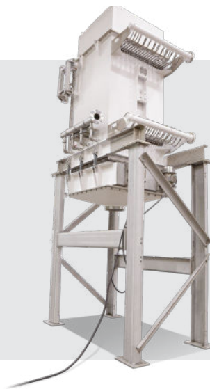
Bulk Material Heat Exchangers