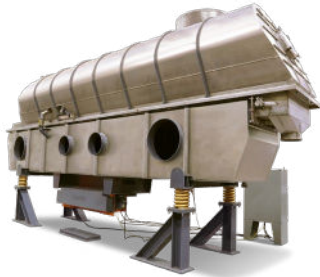
Vibrating Fluid Bed Dryers / Coolers

Thermal processes such as drying, cooling and calcining have been expertly refined by CPEG companies over many years of solving unique processing challenges. Our thermal processing equipment delivers cost-effective, optimized and efficient processes to industries around the globe.