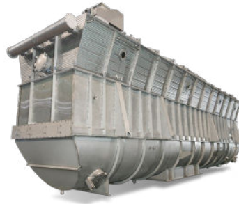
Static Fluid Bed Dryers / Coolers