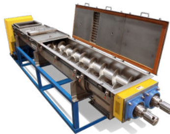
Thermal Screw Mixers