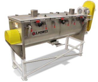
Batch & Continuous Mixers