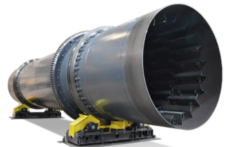
Rotary Dryers / Coolers