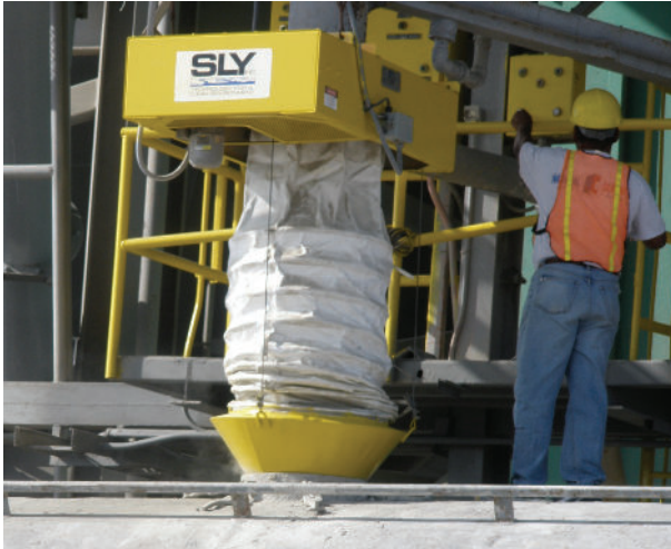
National Cement's latest Sly spout, a Model XP-8, used to load bulk transfer trucks.