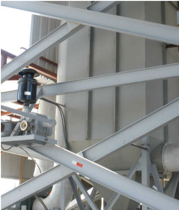
National Cement purchased two Sly pulse-jet collectors for venting the silos and loading spouts.