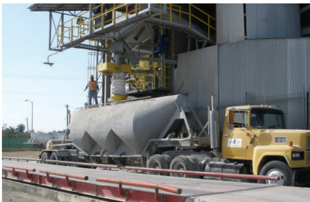
Constant exposure to salt air makes the application tougher than most.

Sly manufactures a full line of dust-free loading spouts, including open, stacking, low profile and hand crank styles.