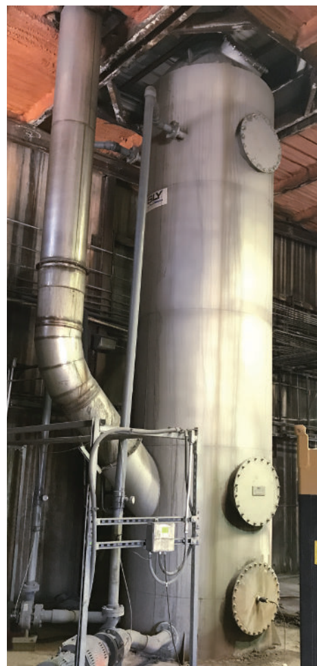
Packed tower for \text{SO}_2 absorption and neutralization for petrochemical industry.

Liquid can often be discharged to the sanitary sewer without further treatment.