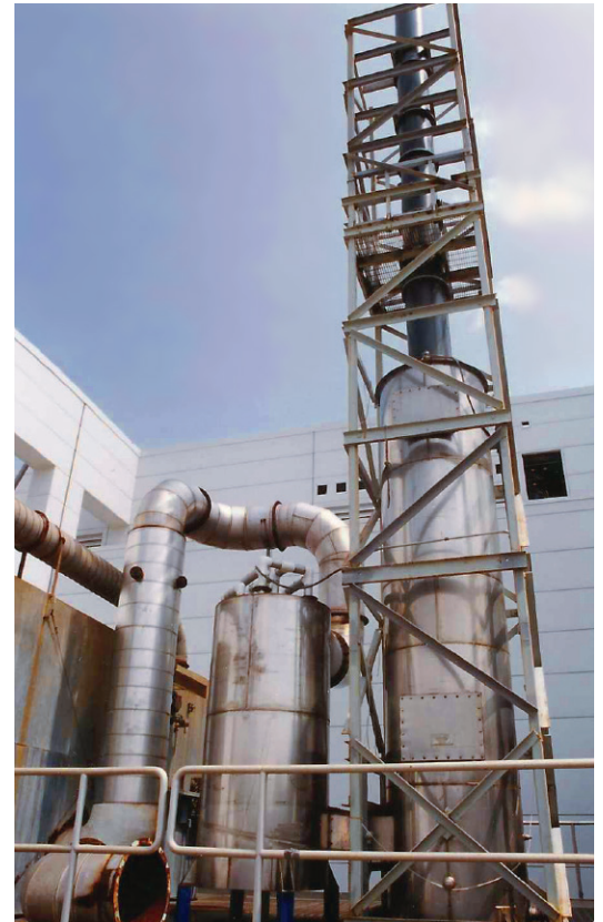
Packed tower and quench of high alloy for pharmaceutical industry.